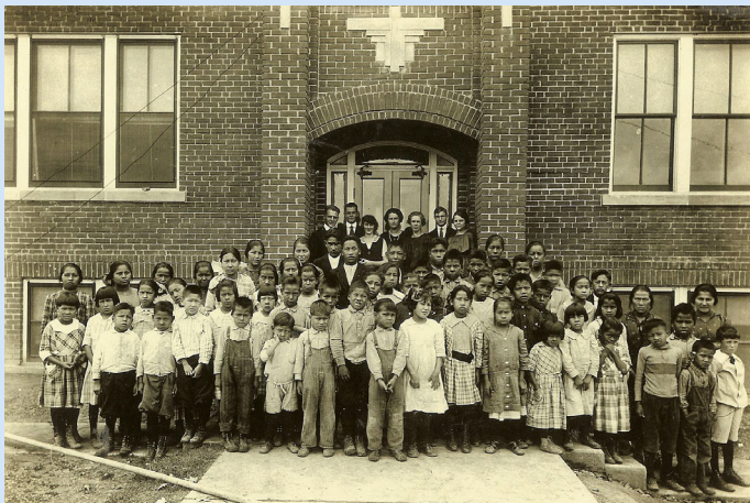
Winnebago Indian School Neillsville, WI (1921-1957)

There were at least 11 boarding schools in Wisconsin.